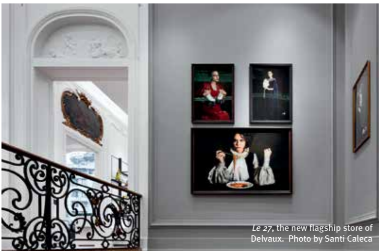
Le 27, the new flagship store of Delvaux.

Until January 20, the artistically diverse Centre for Fine Arts, or BOZAR, is hosting the exhibition Beyond Klimt: New Horizons in Central Europe, 1914-1938 (bozar.be). The major cultural and political changes that occurred in Europe at the outbreak of the First World War and the fall of the Austro-Hungarian Empire brought new artistic waves expressed in the strong voices of individuals as well as creative communities. Through the eyes of the masters of that era (about 75 artists, including Klimt, Schiele, Kokoschka, and Moholy-Nagy), the exhibition reflects on the opulent and diverse scene of Central European art. For some, the major historical changes marked the end of successful careers, for others they indicated new beginnings, artistic challenges, and new forms of broad intercultural communication. BOZAR also invites visitors to dive into the world of virtual reality – filmmaker Frederick Baker has prepared a dazzling VR journey inspired by Klimt’s mosaic panels in the Secession-style Stoclet Palace in Brussels.