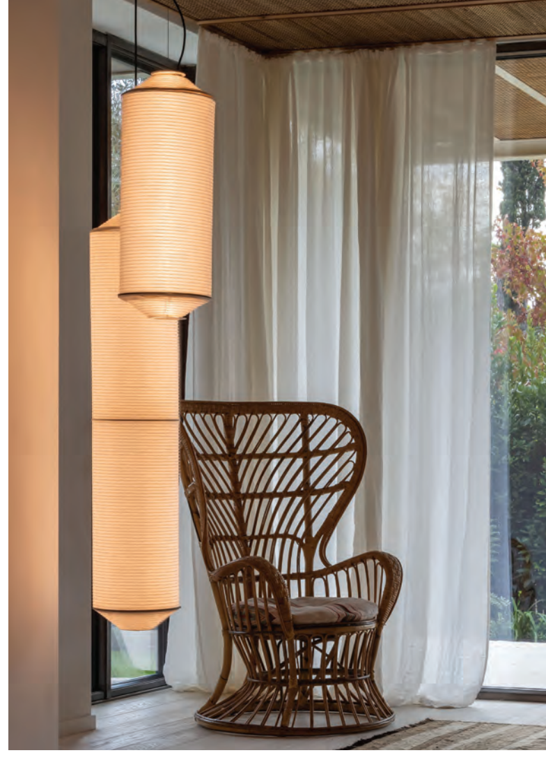
Top left: Stone sink and shower walls designed by Vudafieri Saverino Partners. Top right: Hanging lamps by Santa & Cole. Floor lamp by Fontana Arte. Vintage wicker armchair and vintage rugs. Next page: Sofas by Talenti. Floor lamp by Marset. The open design unites the exterior and interior spaces

achieved by enhancing the glazed areas: installing large windows and glass doors that frame the surrounding lush greenery. Here, the architects not only redistributed and enlarged certain areas in the home to create volume, but also created permeable spaces. This is most notable in the design of the outdoor deck, adding depth to the living room on one side and welcoming in the changing light and verdant foliage of the garden on the other.