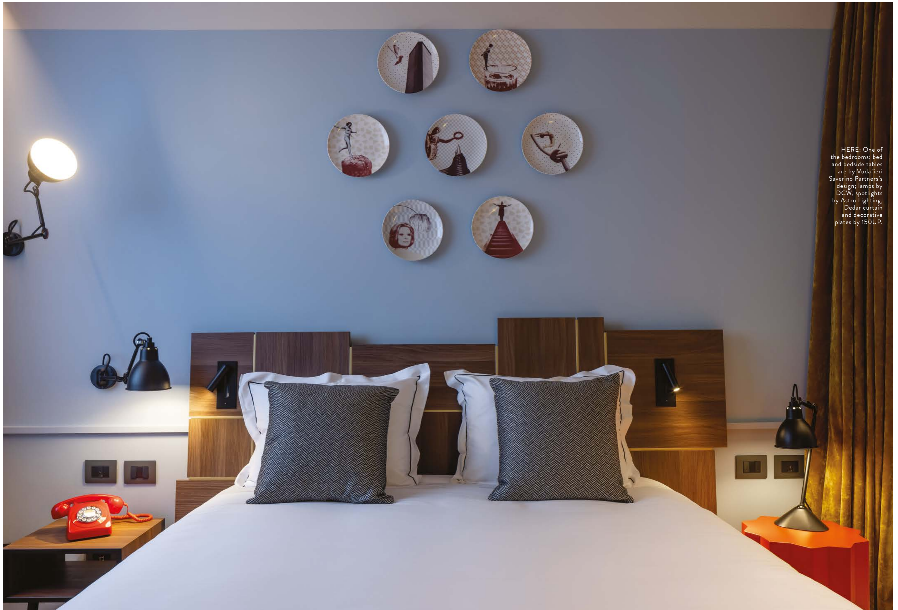
HERE: One of the bedrooms; bed and bedside tables are by Vudafieri Saverino Partners's design; lamps by DCW, spotlights by Astro Lighting, Dedar curtain and decorative plates by 150UP.