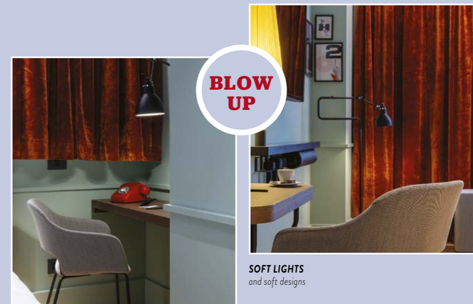
SOFT COLORS and soft materials

Every space designed - residential, commercial, industrial or mixed-use - expresses the close relationship between the values of the client and those of the context, creating a meticulous composition of form and function, sign and detail. The result is a project method that combines the identity of places with a specific "storytelling strategy".