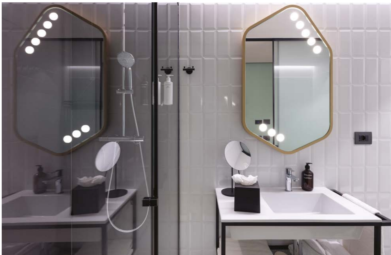
ABOVE, CLOCKWISE: One of the bathrooms of the rooms: the furniture is designed by Vudafieri Saverino Partners; two details of a bedroom.

transformed into a welcoming space where guests and locals can meet for business, a cocktail, or coffee at the bar. The 97 rooms and suites have also been redesigned combining special colour palettes and architect designed furniture to create a sophisticated ambience. A key concept of the project is a 'circular' vision for communal areas, some of which